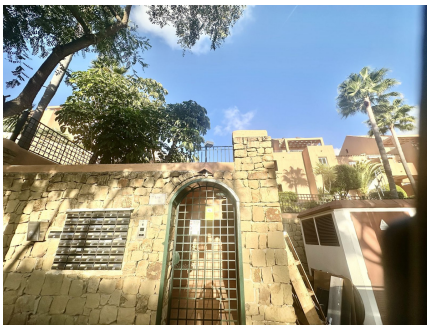
Approximately 41 m 2 total