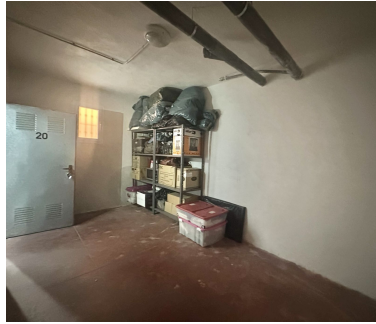
Approximately 14 m 2 total