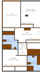
TOTAL 281 m 2 Neto Covered: 274.20 m 2 (100% of the plot) 0.00 m 2 0.00 m 2 INCLUDED AREA: COVERED (274.20 m 2 ) - TOTAL (274.20 m 2 ) - P+0 MCC/001/27.02