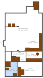
TOTAL 203 m 2 04 - 203 m 2 (203 m 2 ) 04 - 203 m 2 (203 m 2 ) 04 - 203 m 2 (203 m 2 )