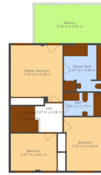
TOTAL 203 m 2 06 - 203 m 2 (203 m 2 ) 06 - 203 m 2 (203 m 2 ) 06 - 203 m 2 (203 m 2 )