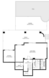
NIVEL 001 00 NIVEL 001 de 00' 00" (0.00 m), PLAN 0.01 (0.01 m) EQUIPAMIENTO: SUELO, PARED, CUBIERTA, PUERTO, VENTANILLA, SILLÓN, TERRAZA, 30 m 2 (3.28 m 2 ), HALL, PASADIZO, 10 m 2