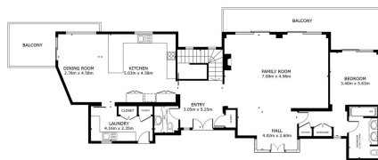
FLOOR 1 GRAND TOTAL AREA: 158.74 m 2 INCLUDED AREA: 158.74 m 2 (FLOOR 1 AND 2 BALCONY) EXCLUDED AREA: 0.00 m 2 (BALCONY, TERRACE, BALCONY AND BALCONY) TOTAL: 158.74 m 2