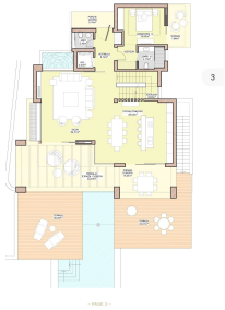
FIRST FLOOR PLANTA ALTA