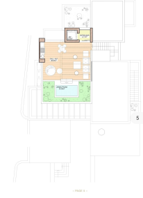
BASEMENT PLANTA SOTANO