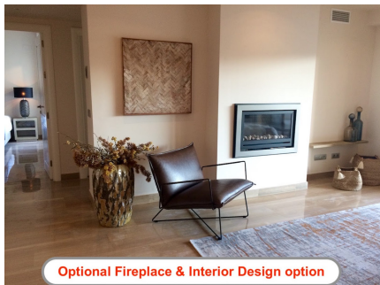
Optional Fireplace & Interior Design option

The built quality is superior to other apartments, whilst still offering a very competitive price per m2 is.