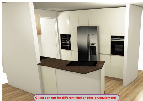
Client can opt for different kitchen (design/equipment)