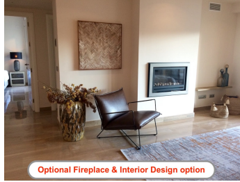
Optional Fireplace & Interior Design option