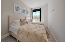
Example furnished apartment - only for illustration purposes furniture not included