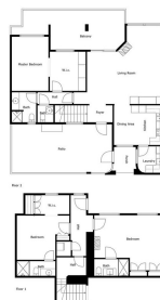
Measurements Calculated And Derived From Satellite But Are Not Guaranteed