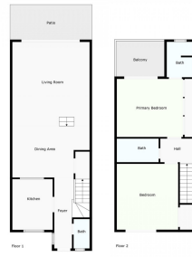
For Illustrative Purpose Only.