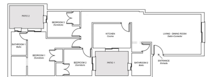
This is a representation of the layout of the property and it is not to scale. Esta es una representación de la distribución de la propiedad y no está a escala.