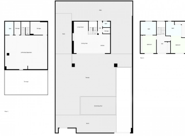
The Illustrative Position Only May Not Be Perfectly To Scale.