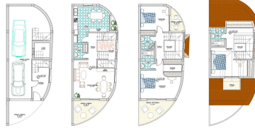
PLANTA BÓVEDA PLANTA B1 PLANTA B2 PLANTA B3