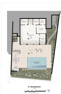
01. Service area