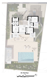
01. First Floor