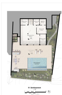
01. Service Area