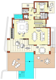
GROUND FLOOR PLANTA BAJA