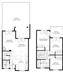
TOTAL: 86 m 2 1st Floor: 50 m 2 ; 2nd Floor: 43 m 2 EXCLUDED AREA: BALCONY: 49 m 2 ; WALLS: 7 m 2