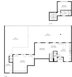
TOTAL: 113 m 2 1st Floor: 89 m 2 ; 2nd Floor: 24 m 2 EXCLUDED AREA: STORAGE: 11 m 2 ; TERRACE: 14 m 2 ; PATIO: 81 m 2 WALLS: 16 m 2