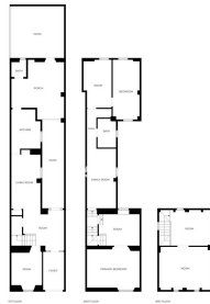
0028 ARE APPROXIMATE, ACTUAL MAY VARY