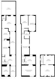
0024 ARE APPROXIMATE, ACTUAL MAY VARY