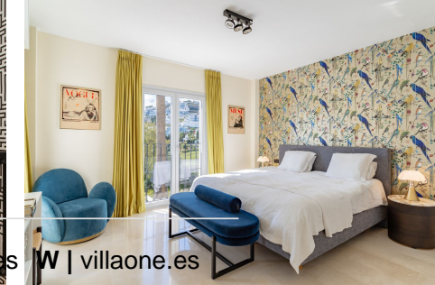
D | Avda. Ricardo Soriano, 72, Edif. Golden B, 1ª Planta, (29601) Marbella, Málaga, España.