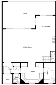
Measurements Calculated and Deemed Highly Suitable But Are Not Guaranteed