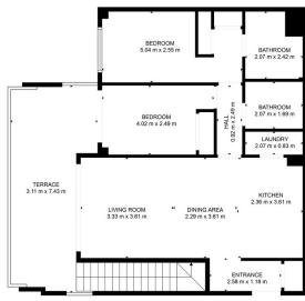
NIVEL 0 - 0 SUPERFICIE ÚTIL: 37,10 m 2 (37,10 m 2 ) INCLUIDO EN EL TERRENO: 10 m 2 (10 m 2 )