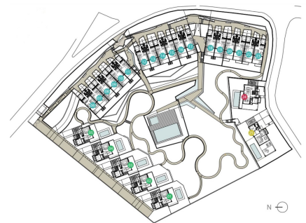
3 Bedroom Townhouse at La Vera de Marbella, Elviria