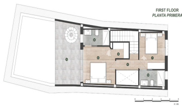
FIRST FLOOR PLANTA PRIMERA