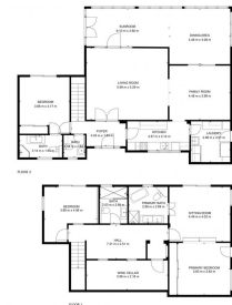
TOTAL 139 m 2 Below Ground: 90 m 2 , FLOOR 2: 141 m 2