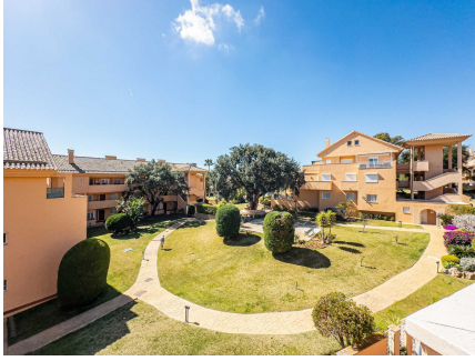
TOTAL AREA: 113.40 m 2 - LIVING AREA: 87.99 m 2 - ROOMS: 6