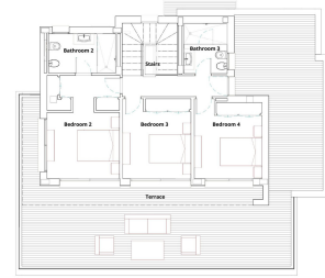
BR001 4 - BAR FIRST FLOOR