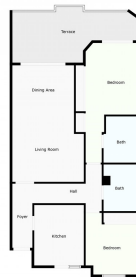
For Illustrative Purposes Only. May Not Be Perfectly To Scale.