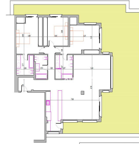
PROYECTO: REFORMA DE APARTAMENTO HOTEL DEL GOLF - C/ LONDRES, S/N - LAS BRISAS MARBELLA - MÁLAGA